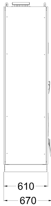
Bottom view ground fixing and cables entry