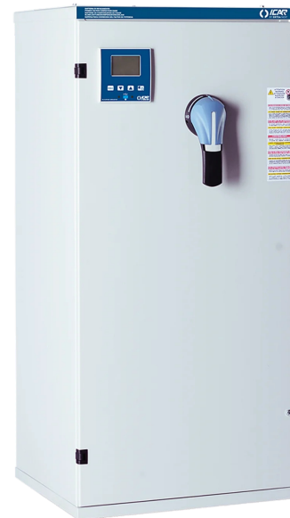
This image is indicative only.

NOTE I cc value: Other values upon request.