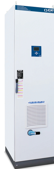
This image is indicative only.

NOTE I cc value: Other values upon request.