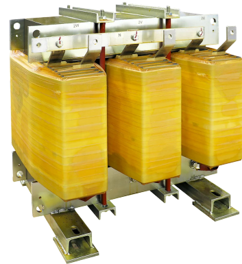
This image is indicative only.