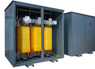
This image is indicative only.