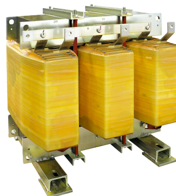
This image is indicative only.